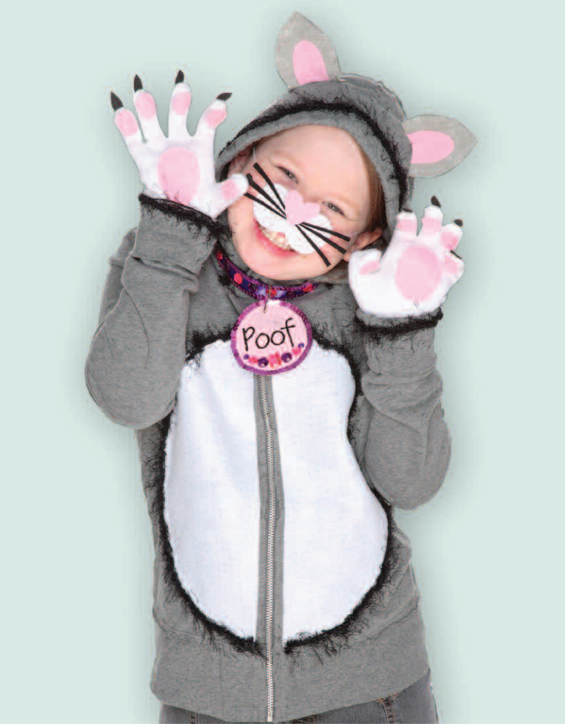
no-sew cat's meow costume