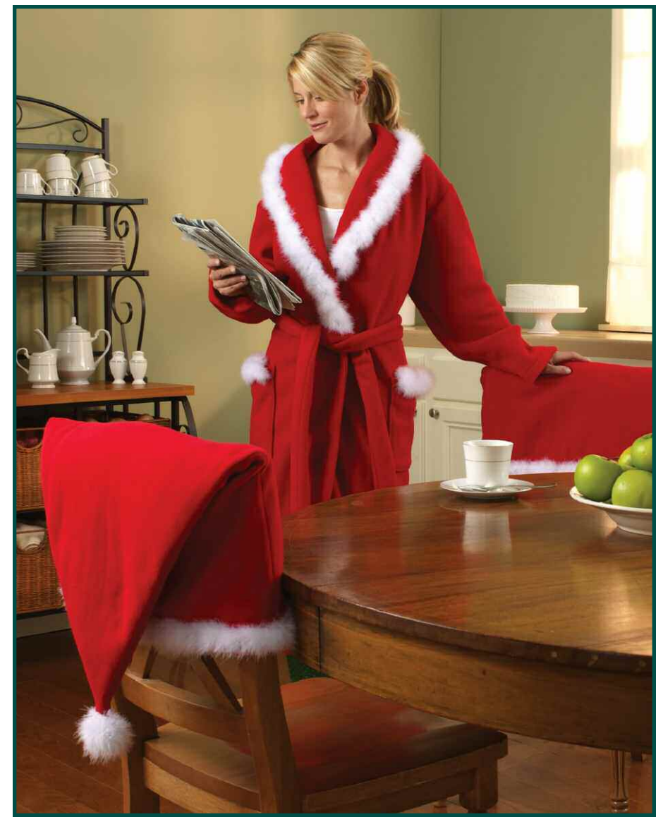
more projects available at Joann.com

Proiect courtesy of Jo-Ann Fabric & Craft Stores