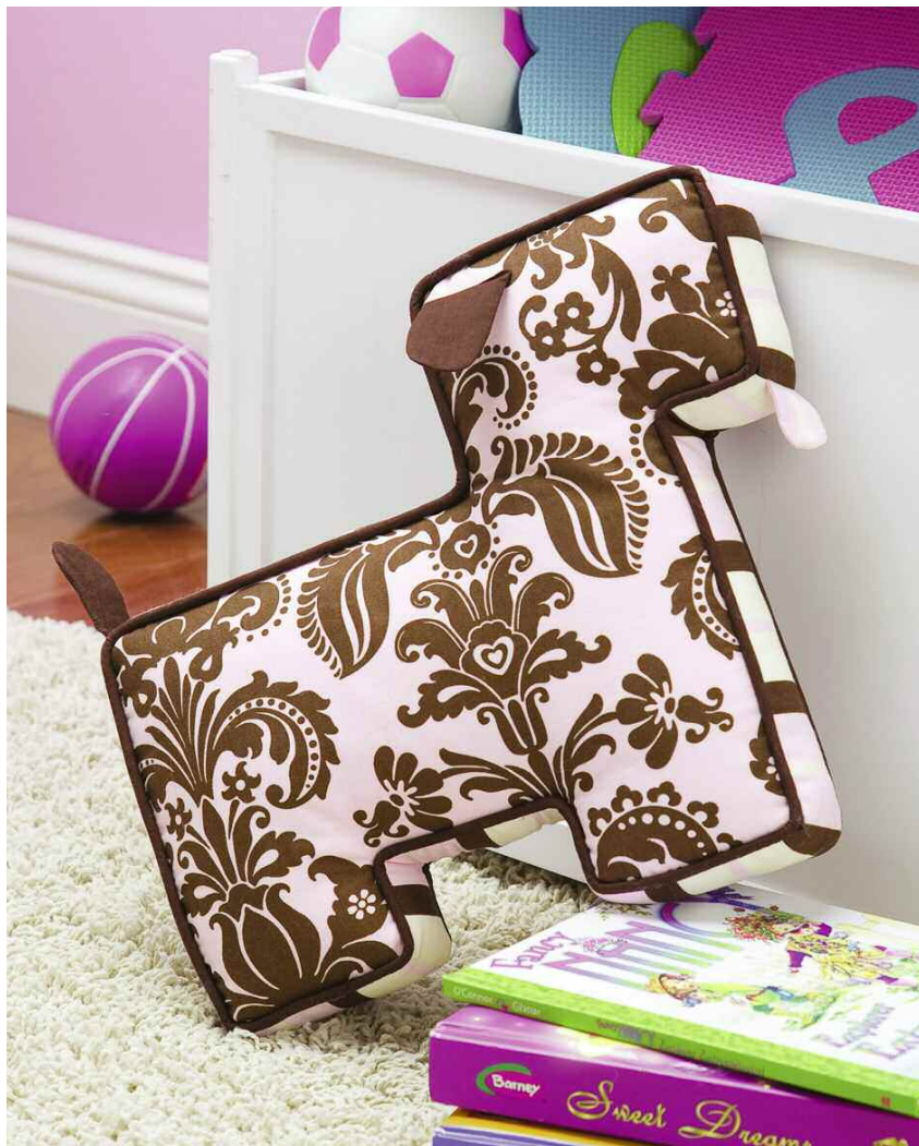
nursery puppy pal

Crafts. Discover life's little pleasures.